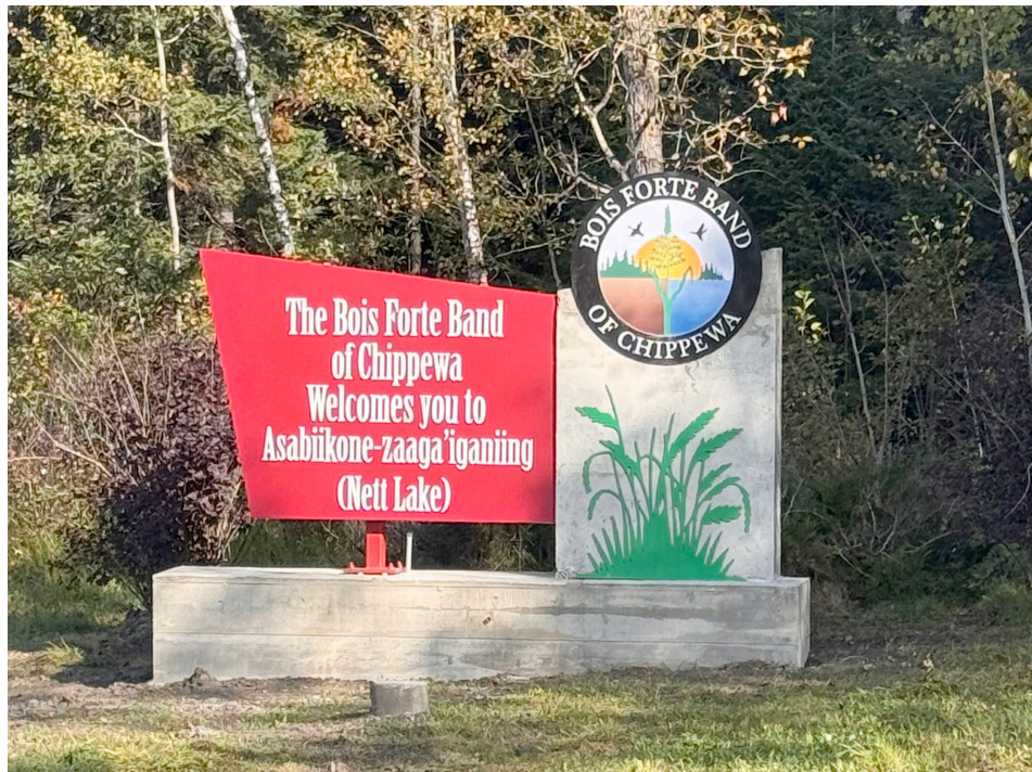
FRESH LOOK!— Here is the finished sign that is located outside the Nett Lake Village.

For more information, please call (612) 231-9719 or send an email to: info@unidos-mn.org