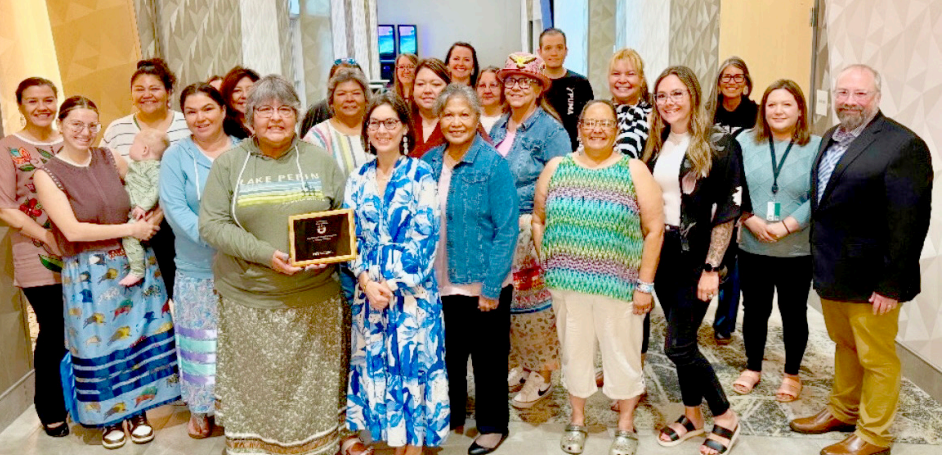
BIG CREW! — Pictured here is the Tribal Collaborative team and representatives from each of the 10 tribes that joined forces to fight homelessness. Great work to you all!