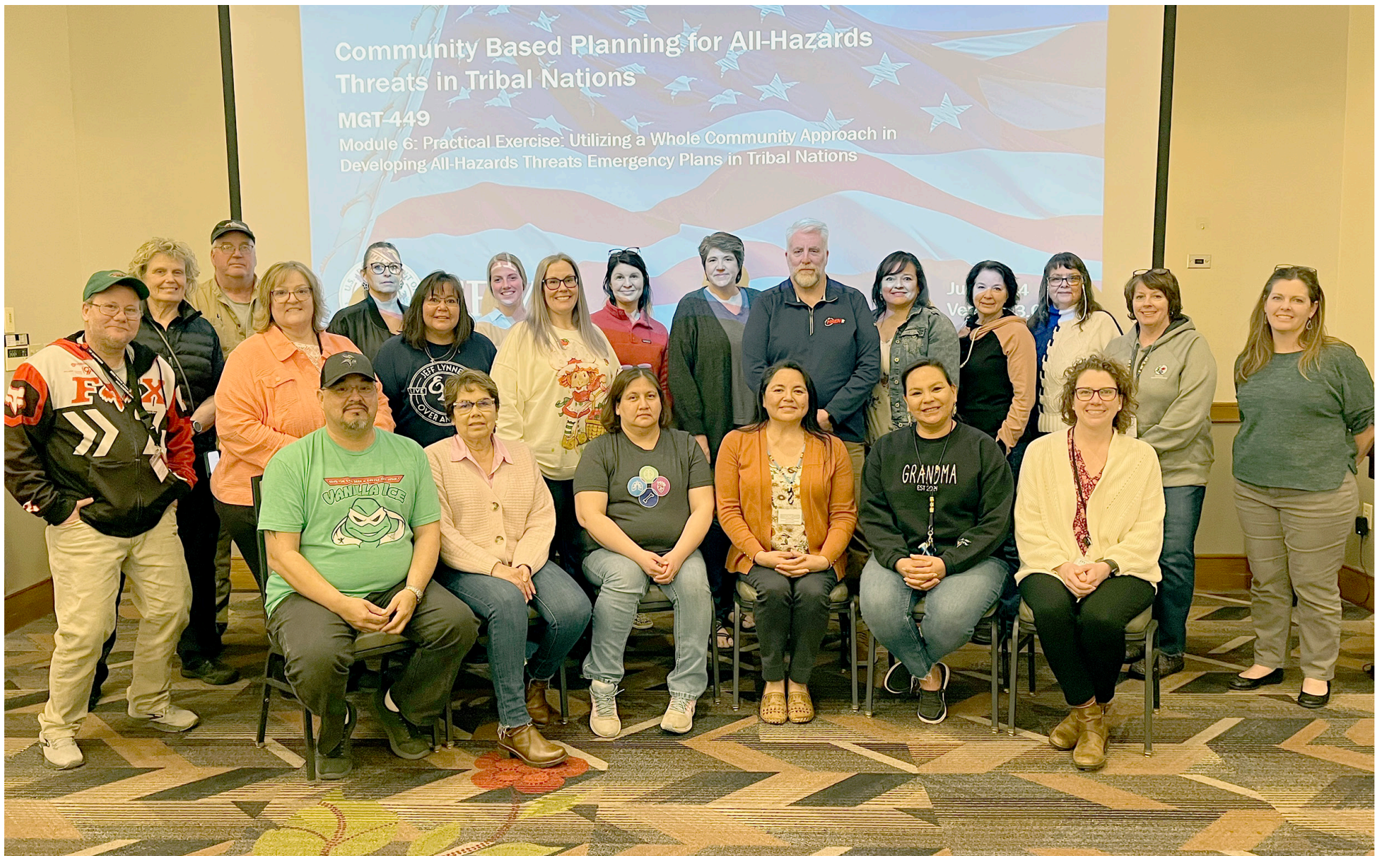
GREAT SESSION!— Pictured here are attendees of the Community Based Planning for All-Hazards Threats in Tribal Nations training that took place at Fortune Bay Resort Casino.