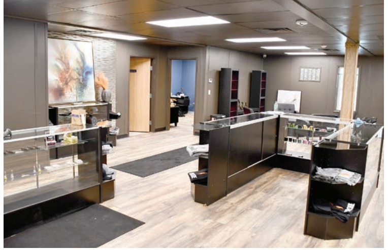
LOOKING GOOD!— This photo shows part of the floor plan at the Ishkode Dispensary. There is also a seating area with a large flatscreen TV, plus an ATM, restrooms, office space and storage space.

not only relates to buying marijuana from another tribe but also a transportation license.