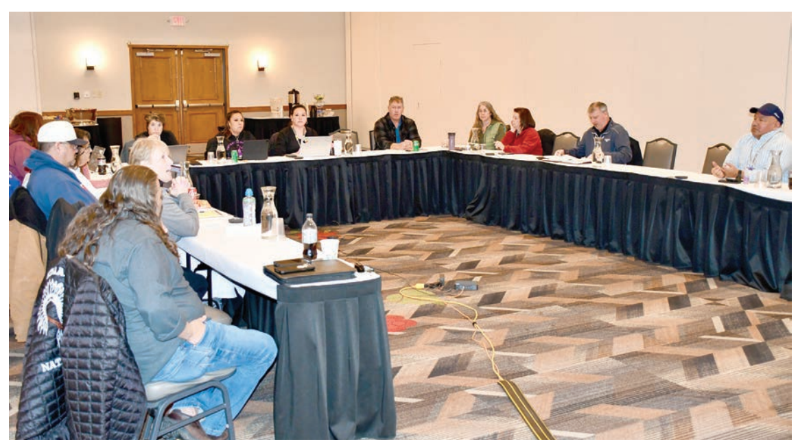
DEVELOPING A GAME PLAN— Members of the Bois Forte Tribal Council met with its senior management team Wednesday, January 29th, at Fortune Bay Resort Casino to go over a game plan should federal funding ever be compromised.

The freeze would have stopped funding for education, food, tribal court, law enforcement, economic development, fire protection, public works, and other programs tribal nations rely on.