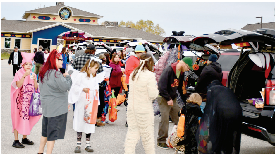
QUITE THE CROWD— Bois Forte's Trunk or Treat event was a huge success! Roughly 200 people came out for the event on Monday, October 28th that was put on by the Vermilion Boys and Girls Club, Bois Forte Health and Human Services Education and Bois Forte's Tobacco Cessation Program.