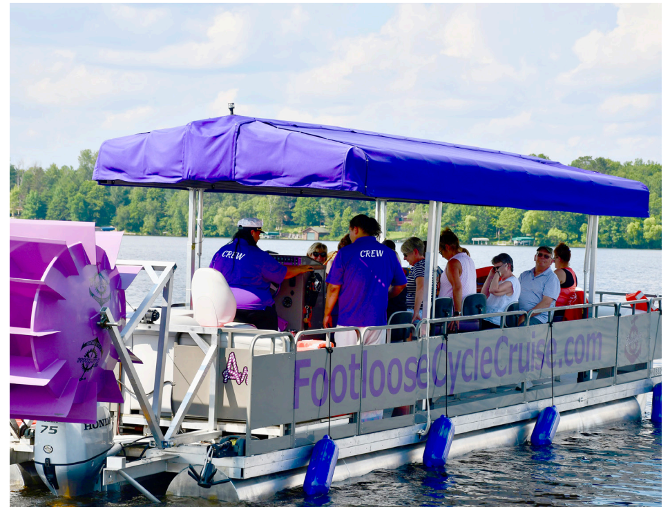
HITTING THE LAKE— The Footloose Cycle Cruise takes out the first guests that showed up for the July 10th Open House that drew nearly 50 people. If you would like to sign up for a tour, please visit www.footloosecyclecruise.com