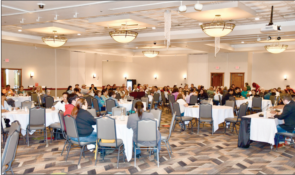
PRODUCTIVE MEETING — Roughly 125 Bois Forte Band members showed up for a community meeting to discuss a wide array of subjects. Given the success of the meeting, more will be planned as the Bois Forte Tribal Council and RTG seeks input from band members on issues facing the tribe.