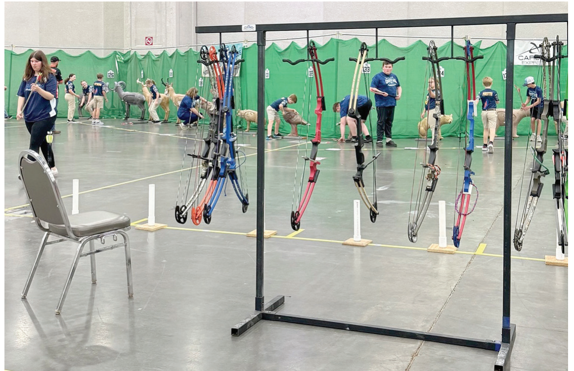
ENJOYING THE EXPERIENCE— Pictured here are some members of the North Woods School Grizzlies' Archery team that made it to Nationals in Louisville, Kentucky.