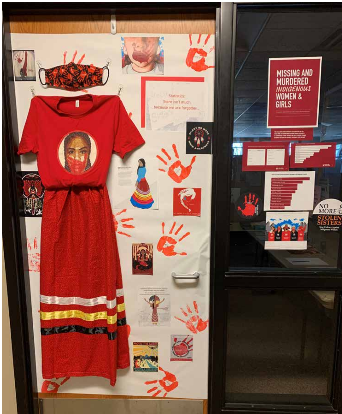
PROFOUND MESSAGE - The people in accounting decorated their office door to help bring awareness to Missing and Murdered Indigenous Women. "No More Stolen Sisters."