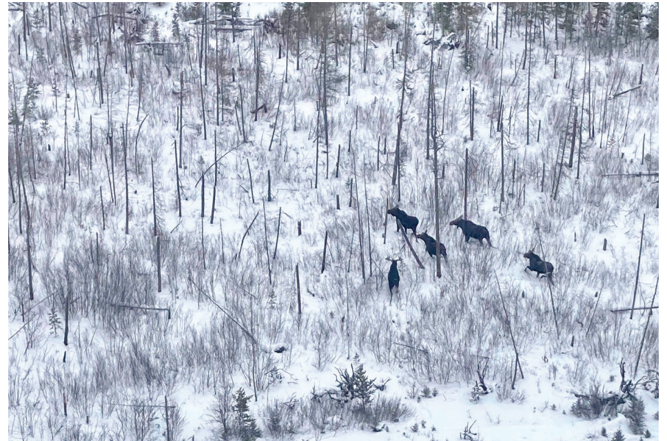
GREAT SIGN!— This is an aerial photograph that the 1854 Treaty Authority staff took while conducting the 2022 moose survey on the Nett Lake Sector of the Bois Forte Reservation. Submitted photo.

We have also been conducting aerial moose surveys on the Bois Forte Nett Lake and Grand Portage reservations through collaborative efforts between Grand Portage Trust Lands, Bois Forte Department of Natural Resources, and the 1854 Treaty Authority. The moose counts during both reservation surveys in 2022 were also the highest that they have been in recent years. We plan to continue these surveys annually to track changes in moose numbers on both reservations.