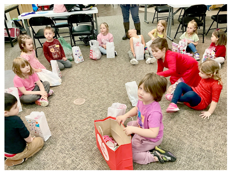
ENJOYING A LITTLE VALENTINE'S DAY PARTY!— The Vermilion Head Start Kids enjoyed a little party on Wednesday, February 14th. Submitted photo.